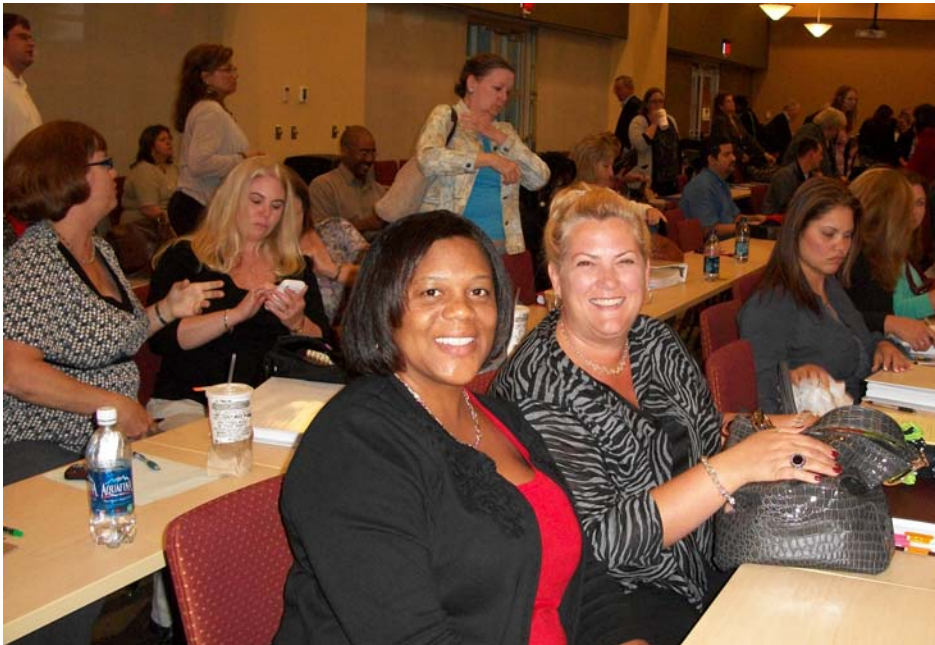
Regulatory Update 2011 was held in Orlando on March 28 and 29 at Valencia Community College West Campus. Both days were well attended.